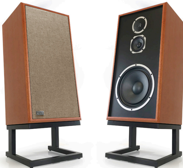
Shown in West African Mahogany

Basalt Black Knit Grille available by special order